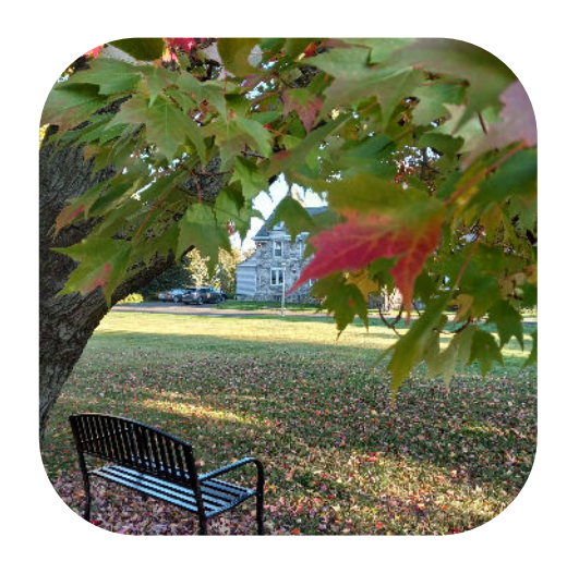
Personal and Individual Retreats

We share a common goal of offering quality experiences to all those that attend and participate. We are also able to support retreat planning both in English and Spanish.